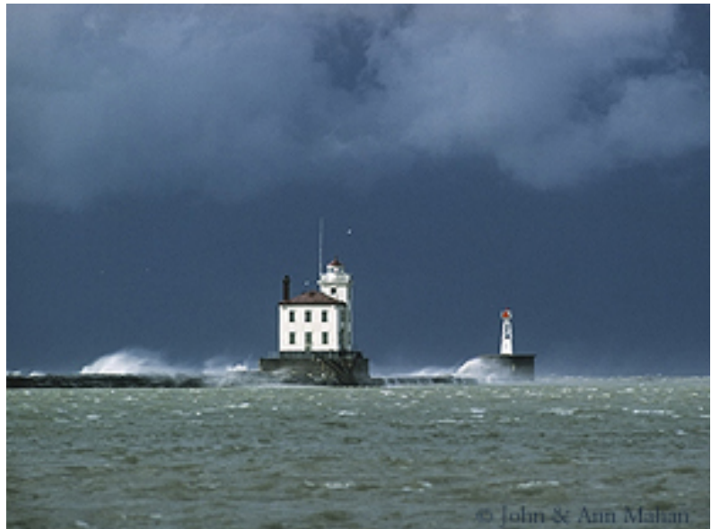
Lake Erie – West Breakwater Light, Fairport, Ohio

Note: In reviewing the Draft of this document, two issues were raised regarding diversions. One is the issue of diversions from one Great Lake to another (inter-basin diversions). The other is the concept that return flow should be as close as practical to the source of the original water taking. These issues were raised at the Wingspread Meeting as being important but were not formally discussed given time constraints. Additional discussion may be required if it is determined that it would be advantageous to have general agreement on these important issues.