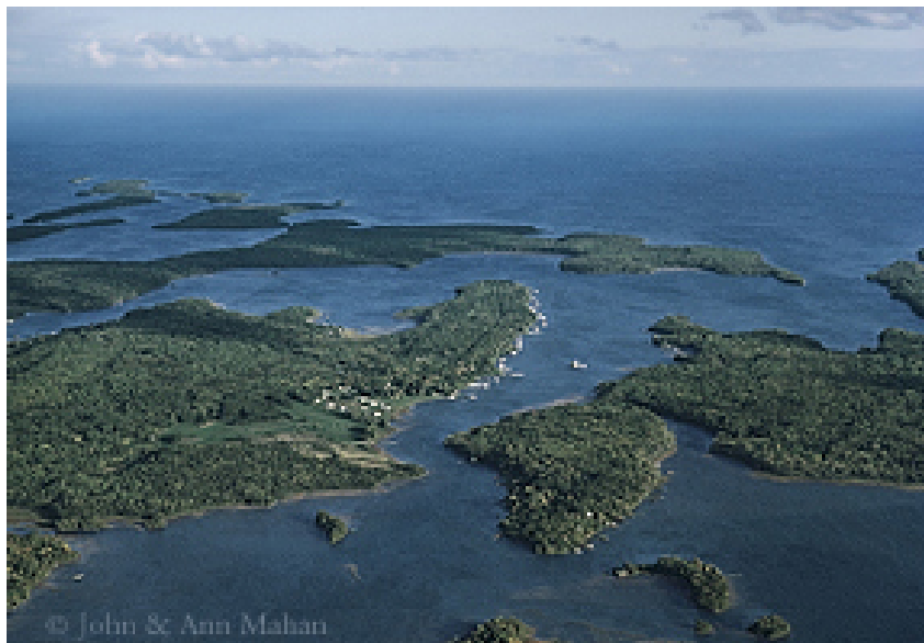
Lake Huron – Les Cheneaux Islands

The Annex should mandate the development of the Long-Term Basin Management Strategy as outlined in the Great Lakes Charter of 1985.