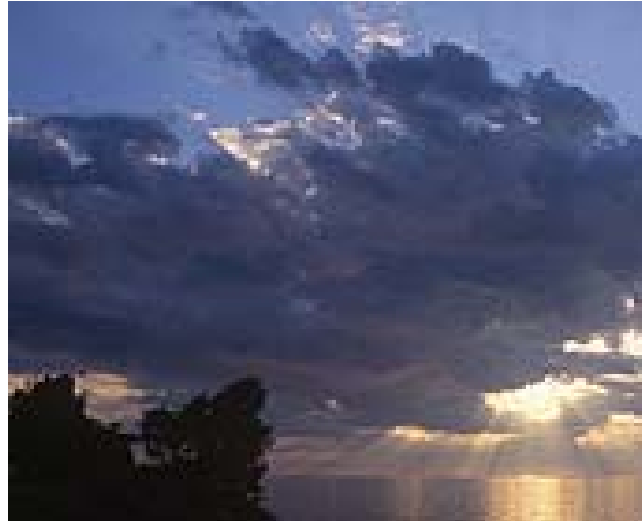
Lake Ontario – Thirty Mile Point