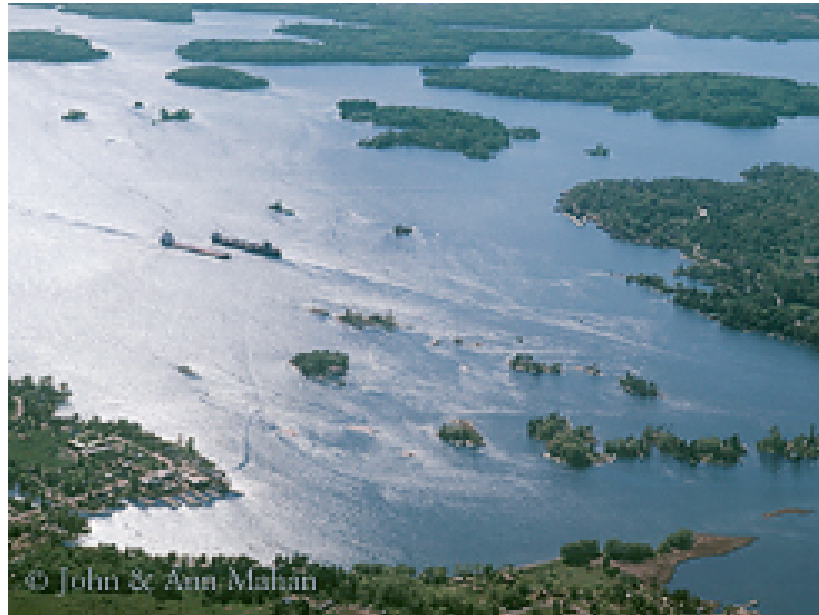
St. Lawrence River – Lake Freighters