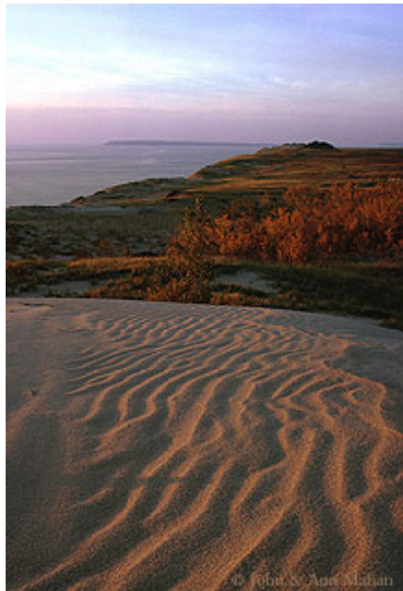
Lake Michigan – Sleeping Bear Dunes

By the end of the workshop, participants were able to reach general agreement on the