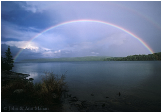
Lake Superior – Rainbow, Isle Royale

The facilitator closed the session with a roundtable for “concluding thoughts” from all participants. There was a very strong sense that workshop objectives had been achieved and, in some respects, even exceeded. Perhaps the most important outcome was the opportunity provided by the Workshop for participants to confirm the commonality of their resolve that cuts across borders and regions in protecting the binational treasure that is the Great Lakes Basin.